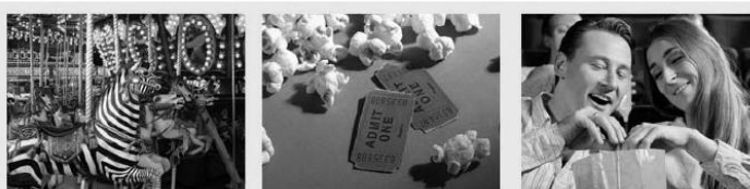
AMUSEMENT PARK TICKET